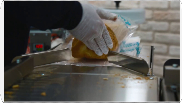
Sliced breads are put into the bag which is opened by blower fan.