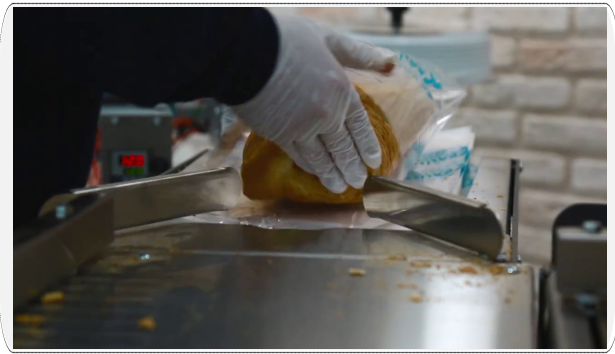
Sliced breads are put into the bag which is opened by blower fan.